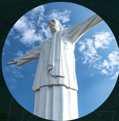
Cristo Rey monument