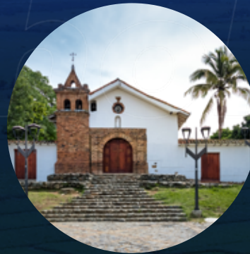
San Antonio historical neighbourhood

Cali, known as the “World Capital of Salsa” and the third largest city in Colombia, is a vibrant and lively tourist destination that offers a wide range of unique experiences, sounds and flavours.