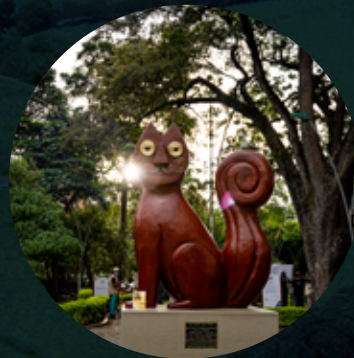
The River Cat sculpture