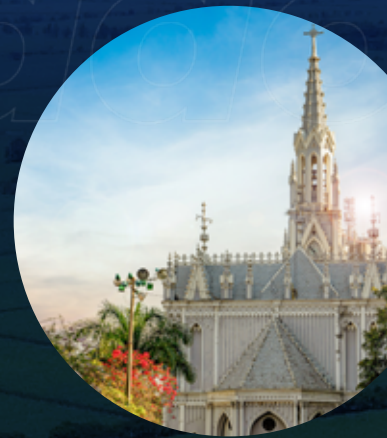
La Ermita church